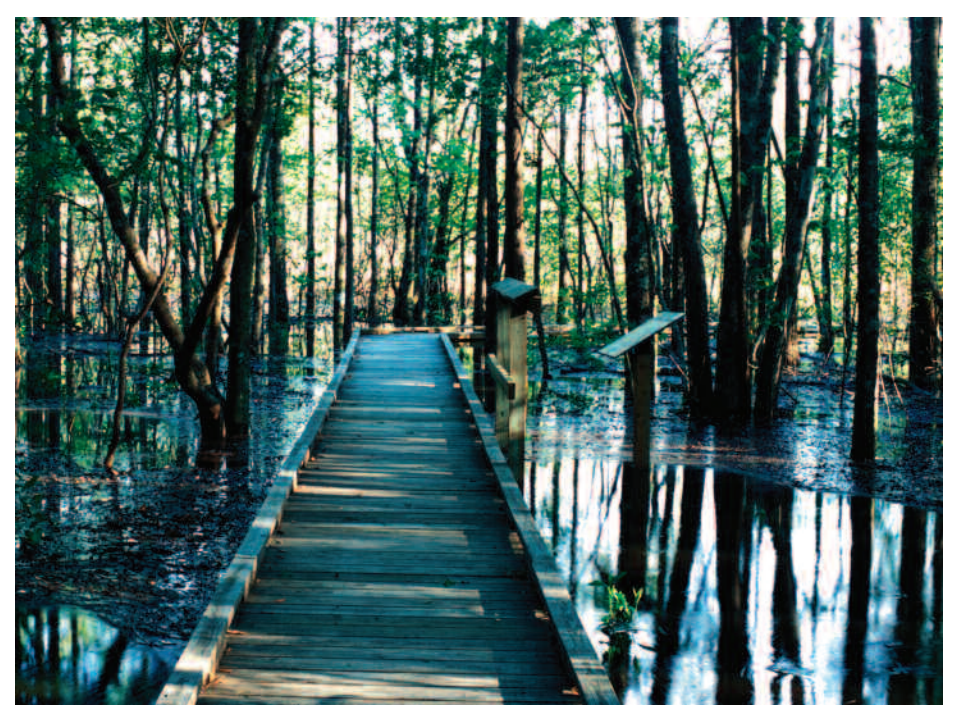
Figure 2: The boardwalk trail at Abita Creek Flatwoods Preserve (Louisiana), during a flood.