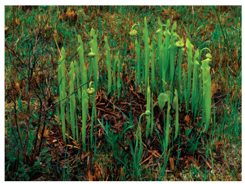
Figure 1: Sarracenia oreophila in North Carolina, just after a burn.