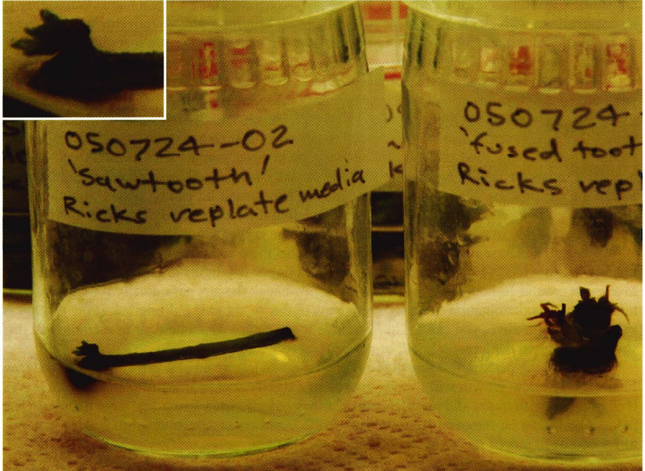
Figure 4: Dionea 'Sawtooth' flower stalk culture at seven weeks. The inset shows the emerging new growth.