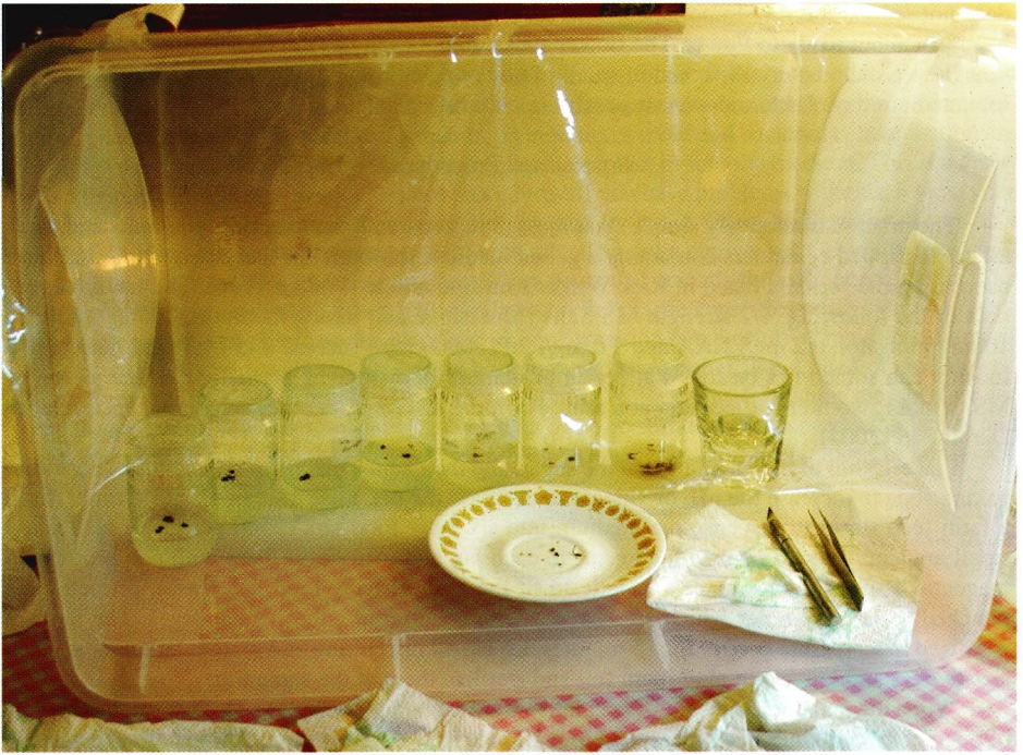
Figure 3: A simple cleanbox or transfer hood.