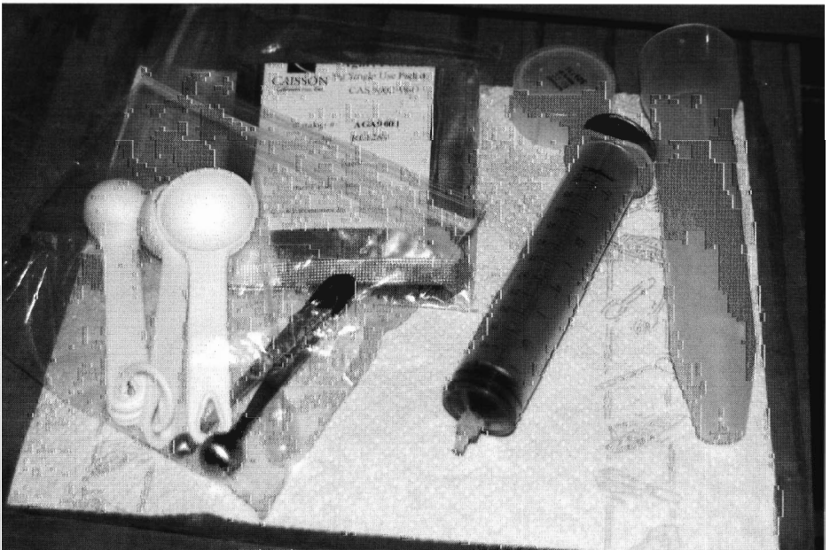
Figure 1: Tissue culture tools and supplies.

This intrigued me because I was spending a lot of money increasing my modest collection, and I wondered if it would be possible to propagate carnivorous plants this way. Planting seed, making divisions or leaf pullings (a very common way to propagate Dionaea ) worked, but was slow. I discovered the “Kitchen Culture Kit” website ( http://www.kitchenculturekit.com ), and decided to try it on my carnivorous plants. My first cultures were Dionaea ‘Dentate Traps’ and Dionaea ‘Red Dragon’ cultivars. Both cultures were successful, with over 25 plantlets of each type being produced from only a single leaf trap cutting from each plant in only a matter of months! Despite the perception that tissue culture is somewhat difficult, and requires an expensive lab environment and equipment, it can actually be done at home with simple equipment for relatively little money (see Figure 1). The “Kitchen Culture Kit” costs less than $100 (US), and includes media, hormones, baby food jar caps, measuring spoons, droppers, pH test papers and instructions with a Material Safety Data Sheet CD.